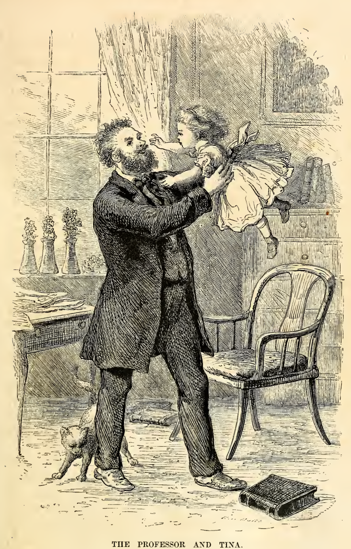
"Come then, my Tina, and haf a goot hug from thy Bhaer."—PAGE 142.