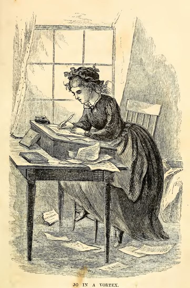
Every few weeks she would shut herself up in her room, put on her scribbling suit, and "fall into a vortex," as she expressed it. —PAGE 44.